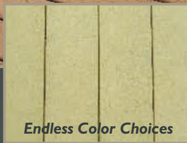
Endless Color Choices