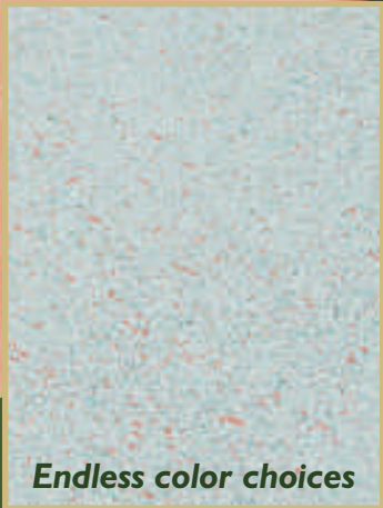
Endless color choices